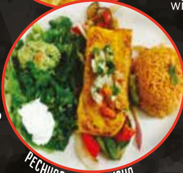
PECHUGA A LA PLANCHA