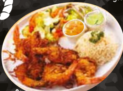
CAMARONES AL COCO