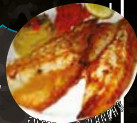
FILETE A LA PLANCHA

fried whole tilapia fish topped with shrimp, served with rice, beans, salad and tortillas