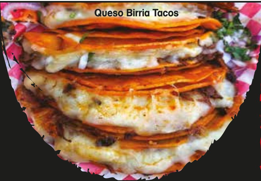
Queso Birria Tacos