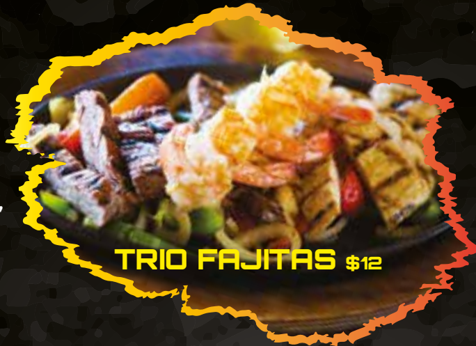
TRIO FAJITAS $12