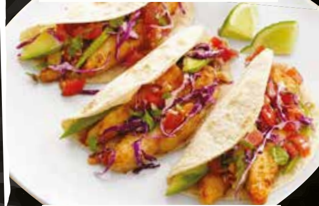
Mahi Mahi Tacos