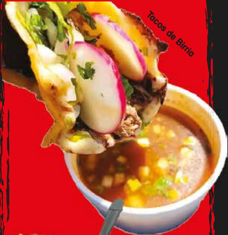
Tacos de Birria