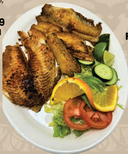
Filete A La Plancha

Fried tilapia, grilled shrimp, tomato, onion, cilantro & pineapple. Mango chipotle sauce. Fries