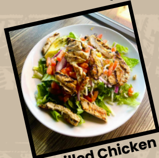
Grilled Chicken Salad