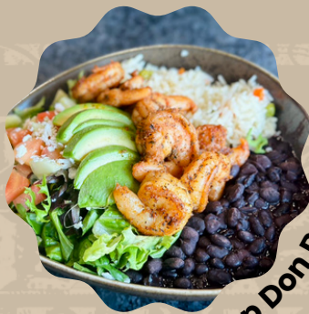
Shrimp Don Bowl