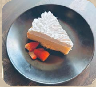
Tres Leches - $9.00