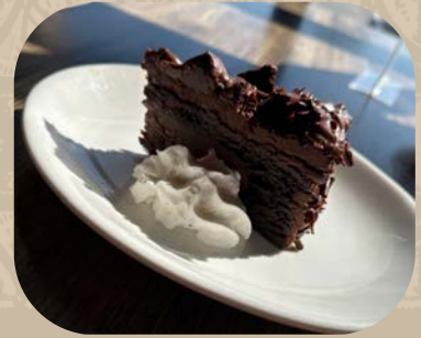
Chocolate Cake - $9.00