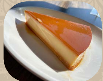
Flan - $9.00