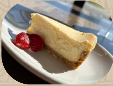
Cheesecake - $7.50