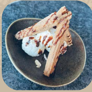
Churros with ice cream - $10.50