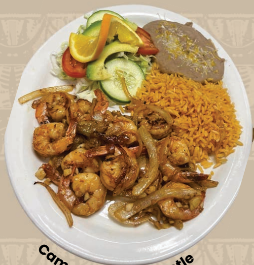
Camarones Al Chipotle