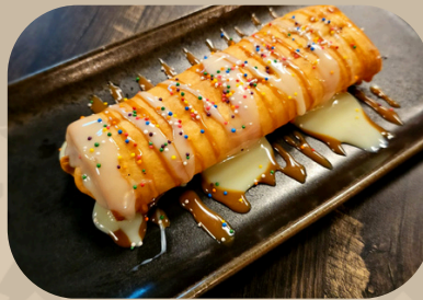
Banana Chimichanga - $9.00